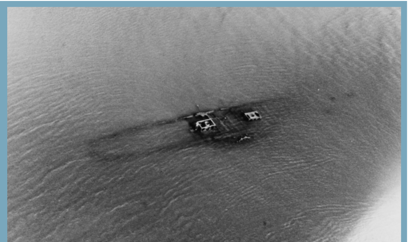
View of Bendigo wreck site as seen from the air.